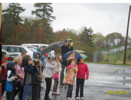
Today it rained melons.